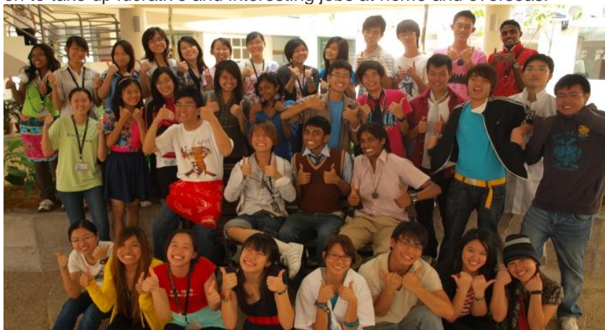
AUSMAT CLASS OF 2010

The AUSMAT qualification is internationally recognised for admission of students to renowned universities in Australia, New Zealand, Canada, United States, United Kingdom, Singapore and many other foreign countries, as well as to local private institutions of higher learning. Numerous Methodist College students have gone on to study mass communication, commerce, biotechnology, engineering, and other interesting courses especially in Australia and Singapore. They have gone on to take up lucrative and interesting jobs at home and overseas.